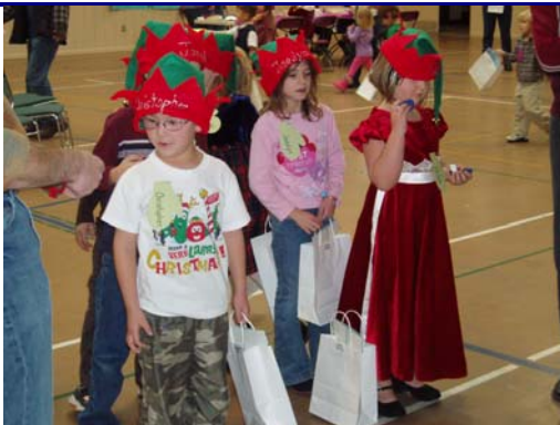
Kindergarten Holiday Party 2009

Tuesday, March 16 th , 2010 at 6:30 p.m. Voting will take place on Governing Documents. Meet us in the library and register to win a Starbucks gift card!