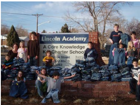
Jean Drive for Haiti

Tuesday, February 16 th , 2010 at 6:30 p.m. Meet us in the library and register to win a Starbucks gift card!